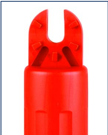
Universal spline for hot stick connection