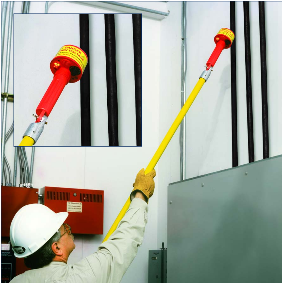
Model 275HVD checking for live voltage on main feeder