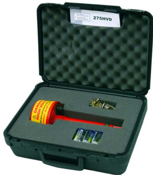
Model 275HVD includes three C cell batteries, a hard carrying case and user manual