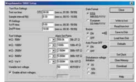
Clear and easy setup from one dialog box for Model 5060.

One button operation starts test and graphs results