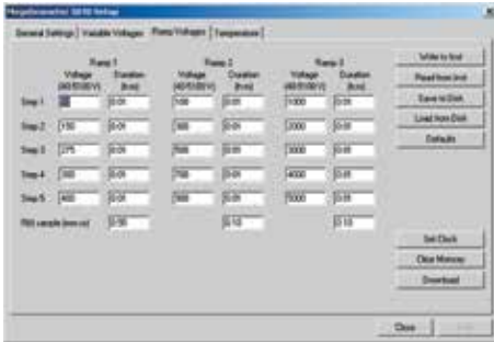
Model 5070 includes Ramp Function which allows programming of three different ramp test profiles, each containing up to five voltage steps between 40 and 5100V and time per step of up to 10 hours.