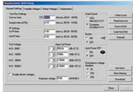
Four tabbed dialog boxes allow for clear and easy setup of all functions of the Model 5070, including setup for variable voltage and alarm set points, as well as step voltage tests and temperature compensation.