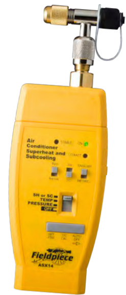
ASX14 Superheat and Subcooling Head for Air Conditioning