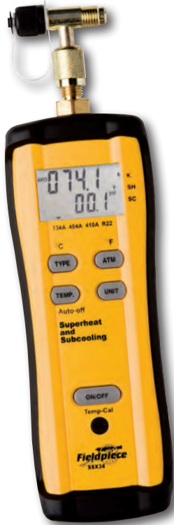
SSX34 Standalone Superheat and Subcooling Meter for A/C and Ref