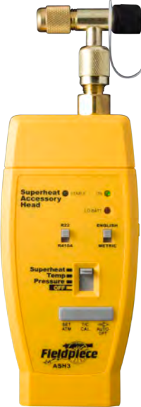
ASH3 Superheat Head for A/C